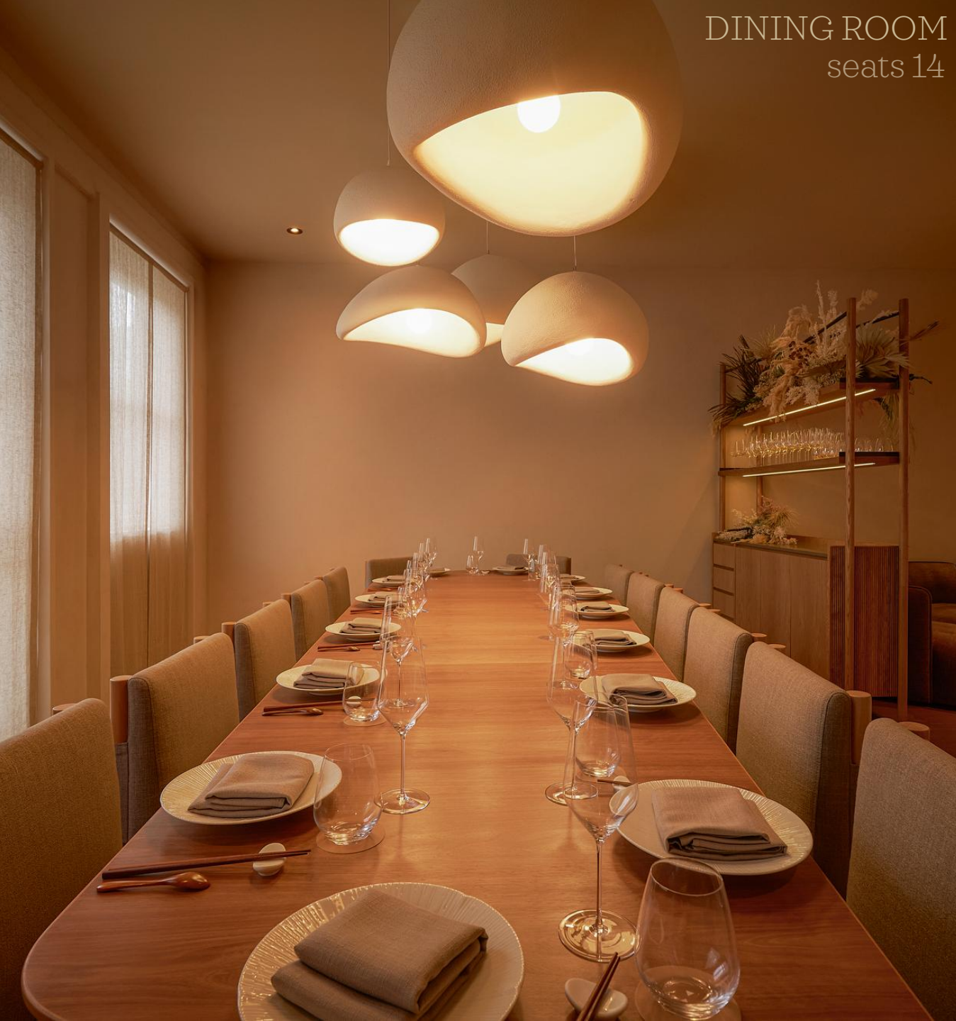
DINING ROOM seats 14